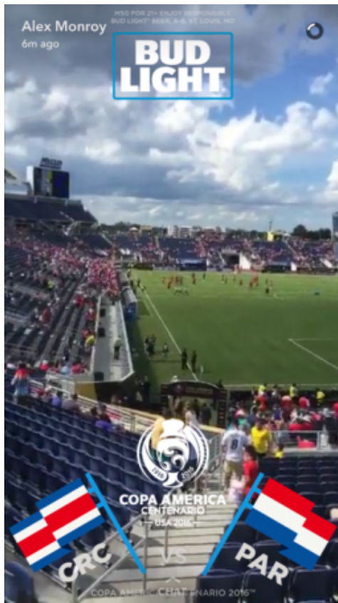
Bud Light's Copa Filter

A-B InBev found similar success with a Snapchat campaign for its Shock Top beer brand earlier this year that was coordinated with a larger Super Bowl effort. The brand partnered with Snapchat in an early test of its long-form video ad format that expands when users swipe up from a regular snap ad. Shock Top's long-form video drove a 40% lift in purchase intent, according to Snapchat and Millward Brown.