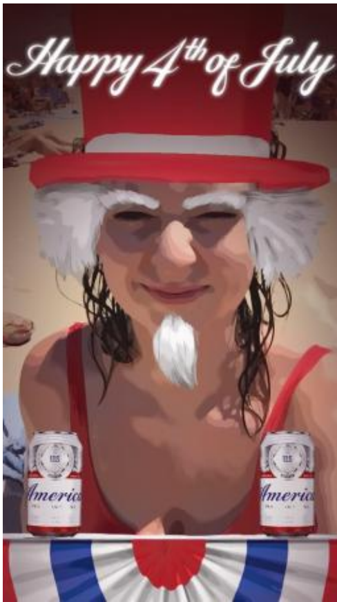
Bud's sponsored Snapchat lens marked a beer first

Some alcohol marketers are using lenses and filters fairly aggressively. A-B InBev on the Fourth of July created the first-ever Snapchat lens for a beer brand. It imposed a Budweiser branded Uncle Sam image over selfies. In May, the brewer ran a national Snapchat filter for Lime-A-Rita for Cinco de Mayo, which it said generated 64.8 million views.