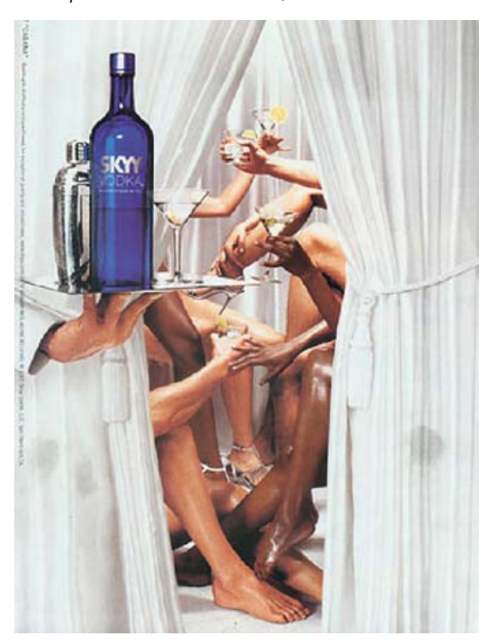
Image 2: This Skyy Vodka advertisement was determined by DISCUS to not violate provision 25 (appealing to sexual prowess or sexual success).

Provision 7 states that distilled spirits "should not be advertised or promoted by any person... who is made to appear to be below the legal purchase age." Provision 13 states spirits advertising "should not depict situations where beverage alcohol is being consumed excessively or in an irresponsible manner," and that "they should not promote the intoxicating effects of beverage alcohol consumption." However, many ads featuring drinking often suggest irresponsible drinking. Provision 22 prohibits advertising that "degrades the image" of various groups; once again, a highly subjective clause.