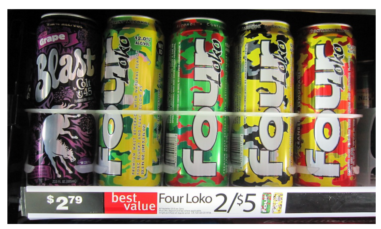
A Report by Alcohol Justice